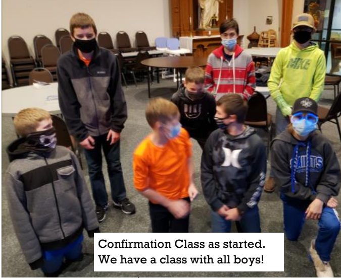
Confirmation Class as started. We have a class with all boys!